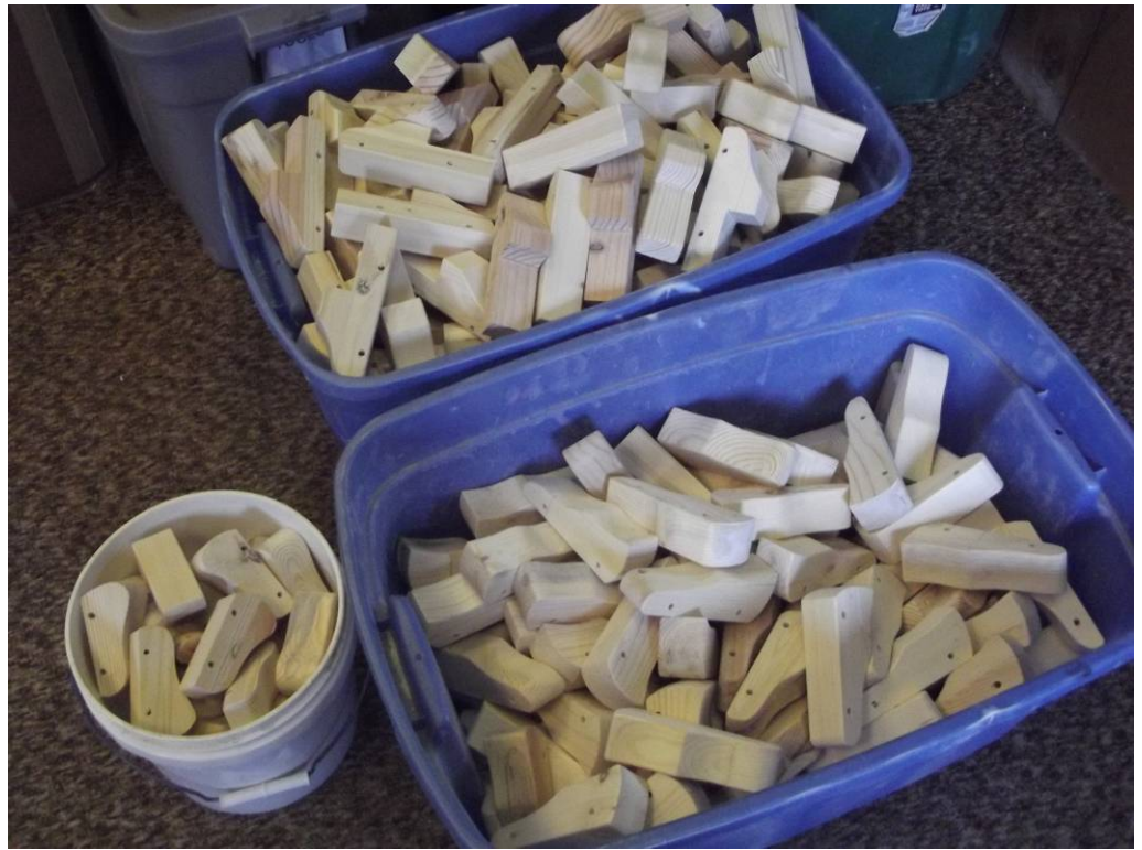
Thanks to Jim Zajicek for the 2x scraps used to cut these car bodies in preparation for the 2018 MWA Christmas Toy Project.