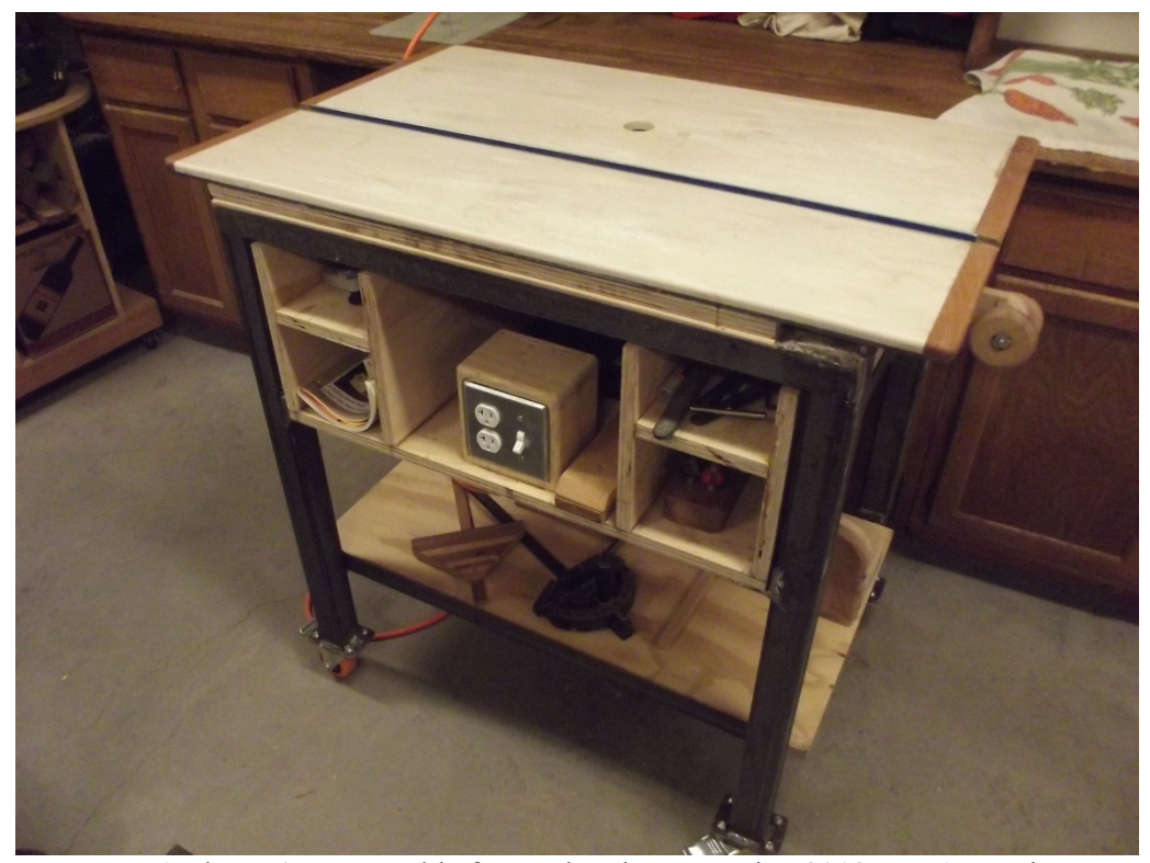
Norm Anderson's router table featured at the November 2018 MWA meeting.

"You're scheduled to give a demonstration on dovetails tomorrow at 2:30."