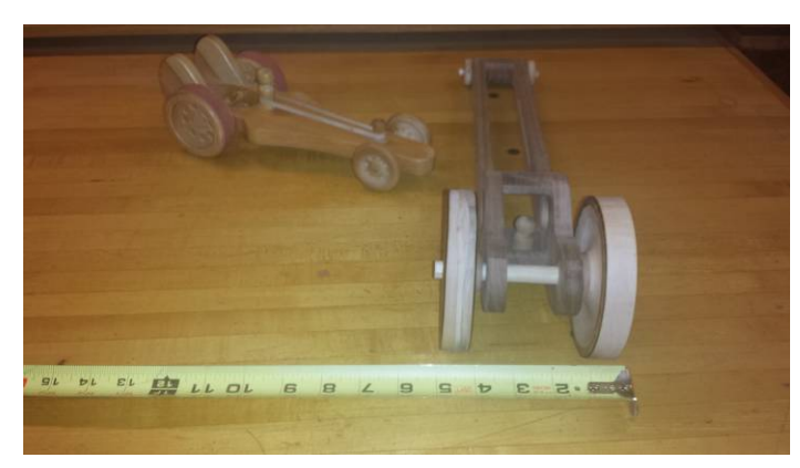
OTHER DESIGNS I FOUND ON LINE, BUT NOT THE BEST YET!